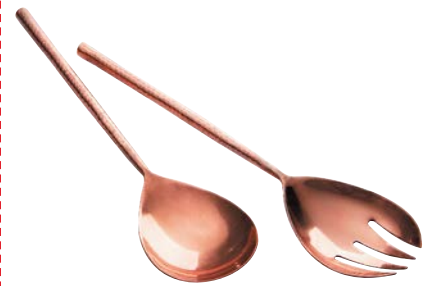
Two-piece set of metal servers , R350, Woolworths.