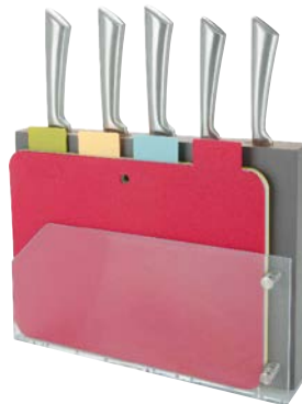
Knife block and board set , R699, @home.