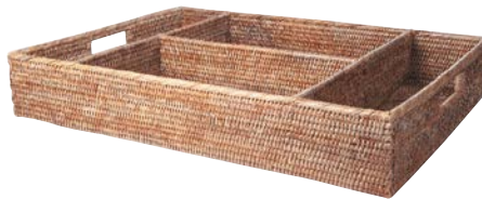
Large drinks tray , R1 900, The Private House Company.