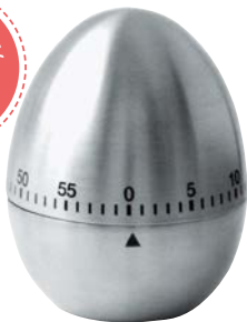
Stainless steel egg timer , R89,99, Eetrite.