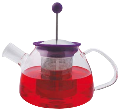
Glass teapot with French press diffuser, R484,50, The Tea Merchant.