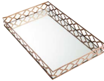
Quadra mirror tray , R875, Woolworths.