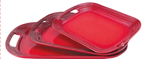
Barbeque platters , from R470 each, Le Creuset.