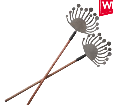
Pincushion salad servers , R312, SANTOS. ▷