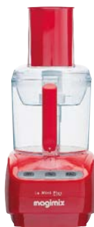
Magimix Le Mini Plus food processor , R2 999, Yuppiechef.com