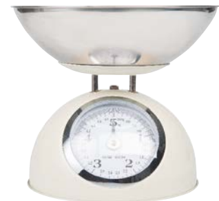
Oval scale , R279, @home.